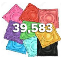
FREE condoms distributed in 2019