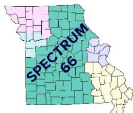
Counties where SHC provides services

Primary Health Care • Medical Case Management • Housing/Utilities Community Health Workers • Free HIV/STD/Hepatitis Testing Free Educational Presentations • Select Co-pay & Medications Assistance