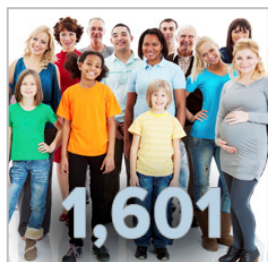
Primary Care Clinic patients in 2019