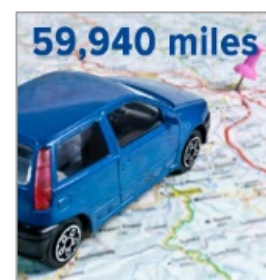
Miles travelled to assist clients