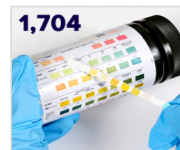
Individuals tested for STIs in 2019 – for a donation or NO COST!